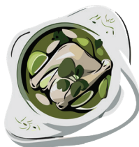
Coq au Vin (French Chicken Stew).