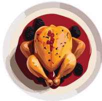
Peking Duck Breast, blackberry compote.