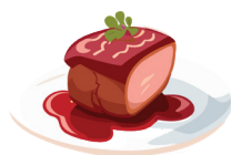
Crispy skin Pork Belly, cherry glaze.